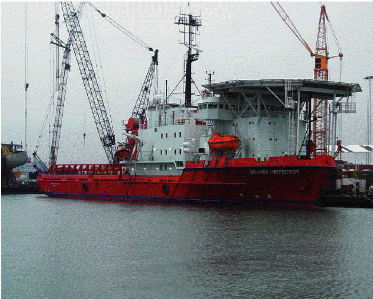
Helideck designed for Super Puma helicopter, delivered to DOF's supply vessel Scandi Inspector.

Helicopterdeck in aluminium from extruded profiles.